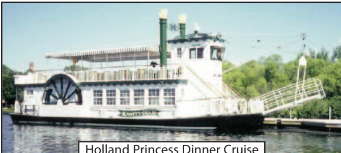
Holland Princess Dinner Cruise